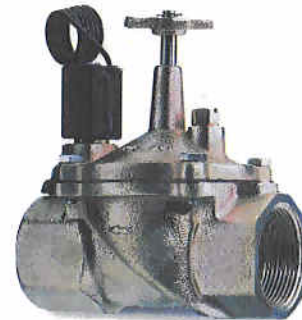
VB15 1 1/2" Brass two-way electric valve