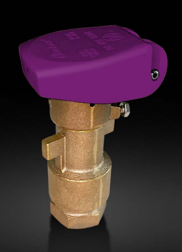
QB 2 Piece Series