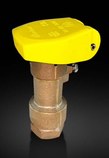
QB 1 Piece Series