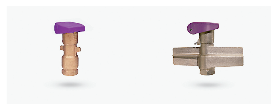
Recycled Water / Non-Potable Applications